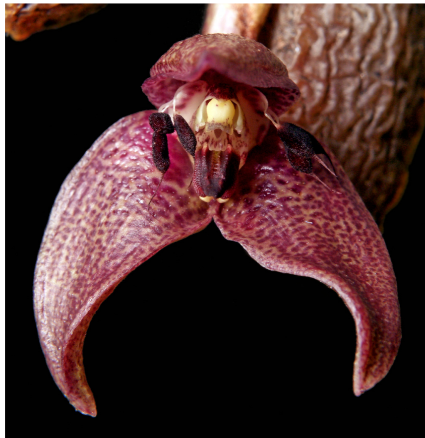
Blumea 55 (2010)

Note — Uniquely identified within the section by the stiffly patent, not pendulous, rhizome. The flower morphology is most similar to B. macneiceae Schuit. & de Vogel, B. tarantula Schuit. & de Vogel, and B. trirhopalon Schltr.; it differs in having the caudate tips to the petal appendages glabrous rather than hirsute.